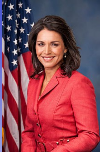
Tulsi Gabbard, Congresswoman 2nd District Hawai'i and a Vice-Chair of the Democratic National Committee.

Tulsi Gabbard was born in Leloaloa, American Samoa in 1981, the fourth of five children. An advocate for environmental policy, Tulsi ran for the Hawai'i State Legislature in 2002 and became the youngest person ever elected. A year later, Tulsi joined the Hawai'i National Guard to serve Hawaii's citizens and our country.