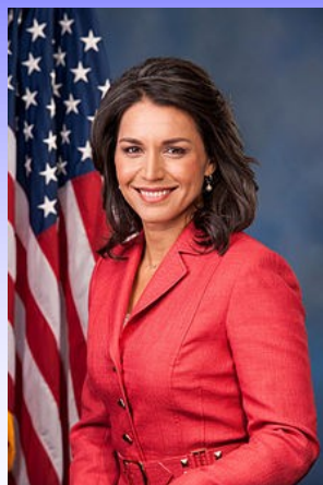
Tulsi Gabbard, Congresswoman 2nd District Hawai'i

Small Business Exhibitor $375 , (small as per SBA size standard) after Feb 28 - $450