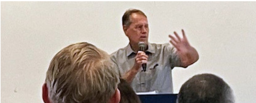
U.S. Rep. Ed Case spoke with attendees at his Veterans Talk Story Session on Saturday, Nov. 23.