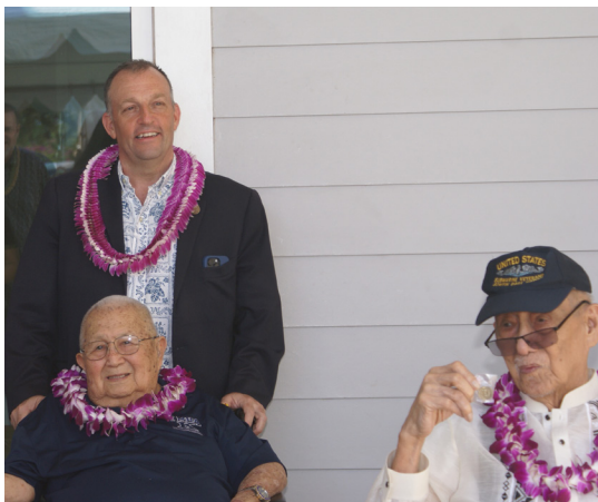
Gov. Josh Green met with a few of the first residents at the DKA SVH.