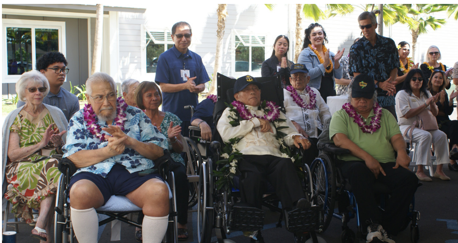
The first residents at the DKA SVH watched the ceremony.